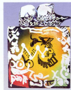
Gilbert Portanier - Square vase, 1999

A leaflet containing a list and details on the signatories is available from members and the Tourist Office.