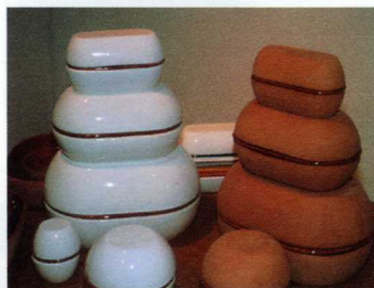
Design Roger Tallon